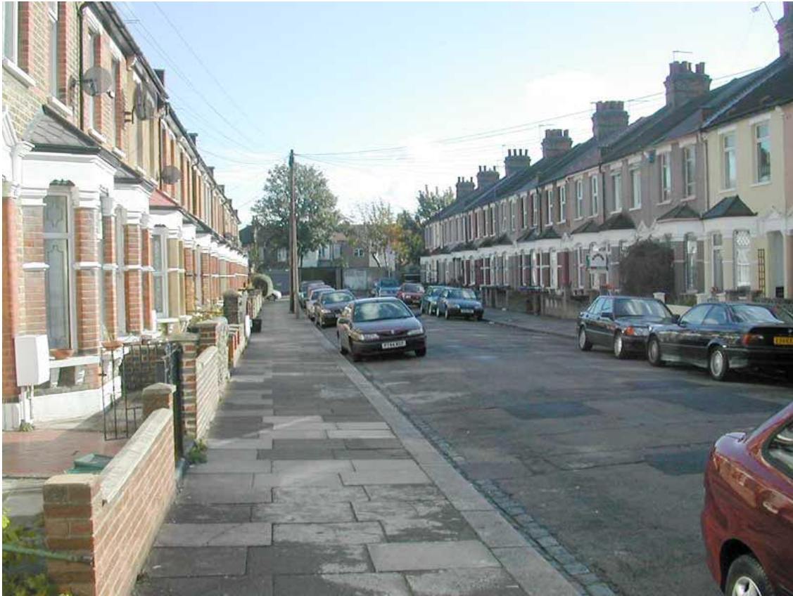
North Road, Edmonton, N. 9. - 2005