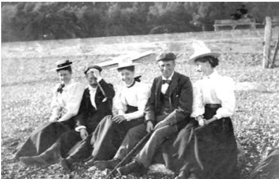
“Folkstone 50 years ago [1898] – 1948”

It is interesting to note what was considered suitable attire for a trip to the sea-side.